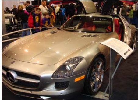
Checking out the new SLS AMG Gullwing at the auto show

were the presence of the new SLS AMG, the E-Class Cabriolet, and the SL65 Black Series.